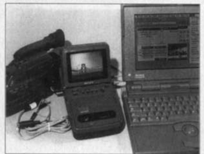
Acquire video footage and log it in the field using VideoToolkit, CCD-V801 or Handycam, CGV-200/300 VideoWalkman and Mac PowerBook

With Video Toolkit, your Macintosh computer, (Plus or greater) and most Sony, Canon, Nikon, Ricoh, and Yashica Hi8 and 8 mm camcorders, as well as Panasonic's AG-1950/60,76/7750, and RS-422 VTRs (BVU, BVW, etc.), you can log and auto-assemble video sequences. Video Toolkit includes all necessary machine control cabling and software.